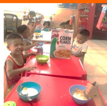
The children were happy to have afternoon Tea– Cornflakes!!!!

The food has been rationed during COVID lockdown (now for the second time). During lockdown, the food is rationed to two meals per day and no morning tea or after school treats. Funding to Kalipay was reduced by 90%. They weren't sure how long the food would last.