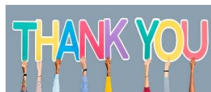
Grateful for our supporters